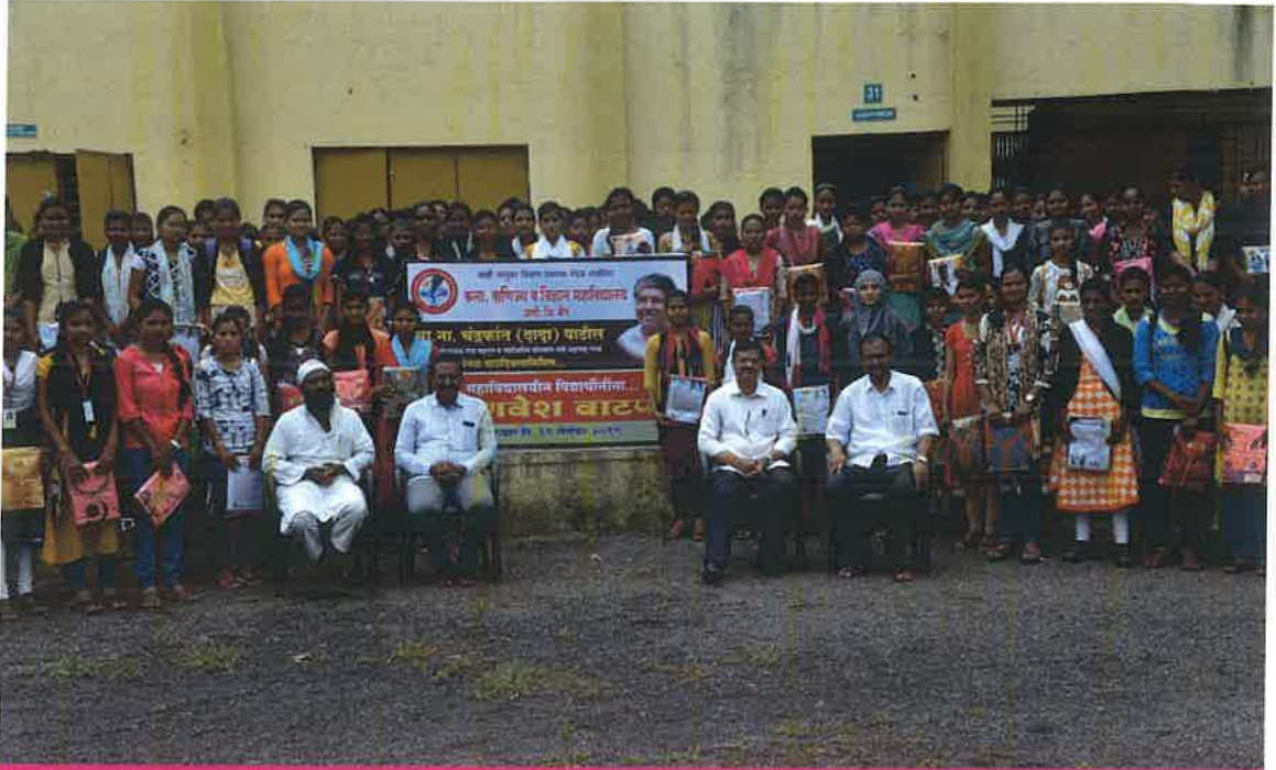
विद्यार्थिनी समुपदेशन व साहित्य वाटप दि. २०/०९/२०१९

Counselling of girl student and distribution of uniforms 20-09-2019