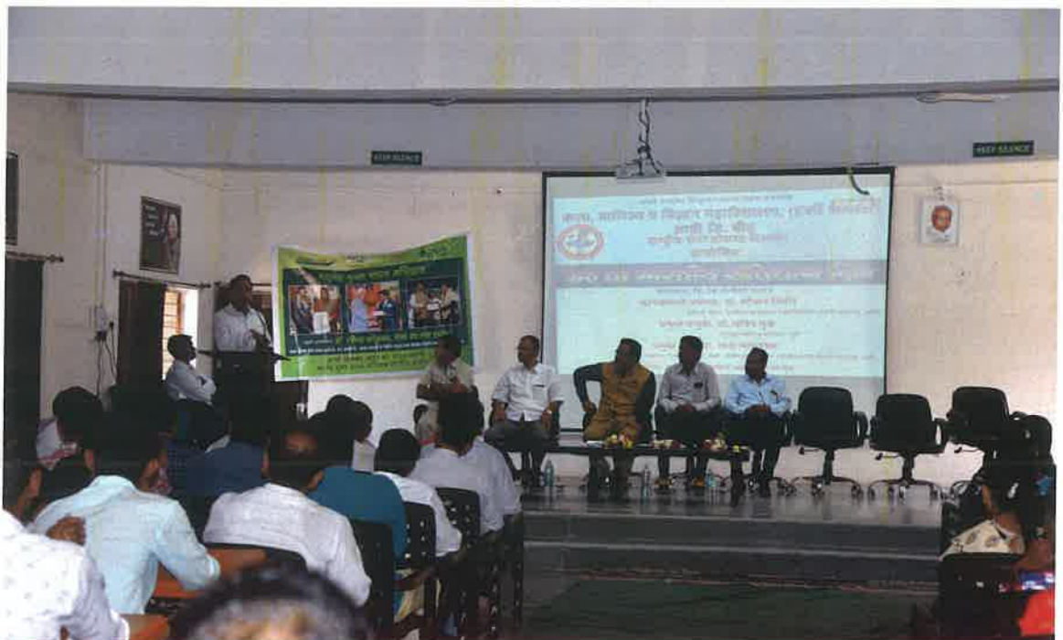
संविधान दिन दि. २६/११/२०१९