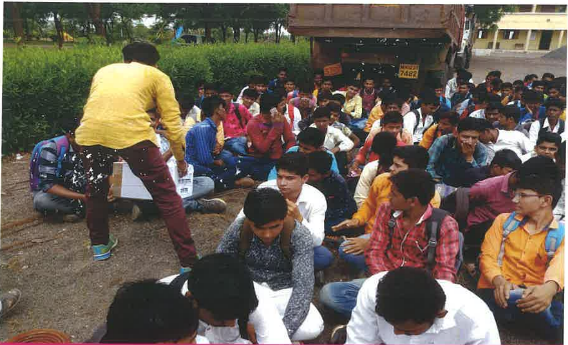
सांगली कोल्हापुर सातारा पुरग्रस्त मदत निधी संकलन दि. १४/०८/२०१९