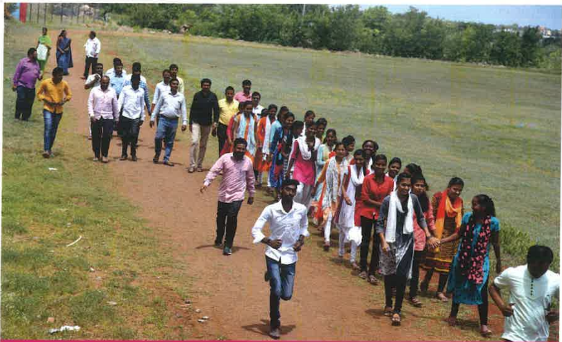
रन इंडिया कार्यक्रम

Chhatrapati Shivaji Maharaj Jayanti 19.02.2020