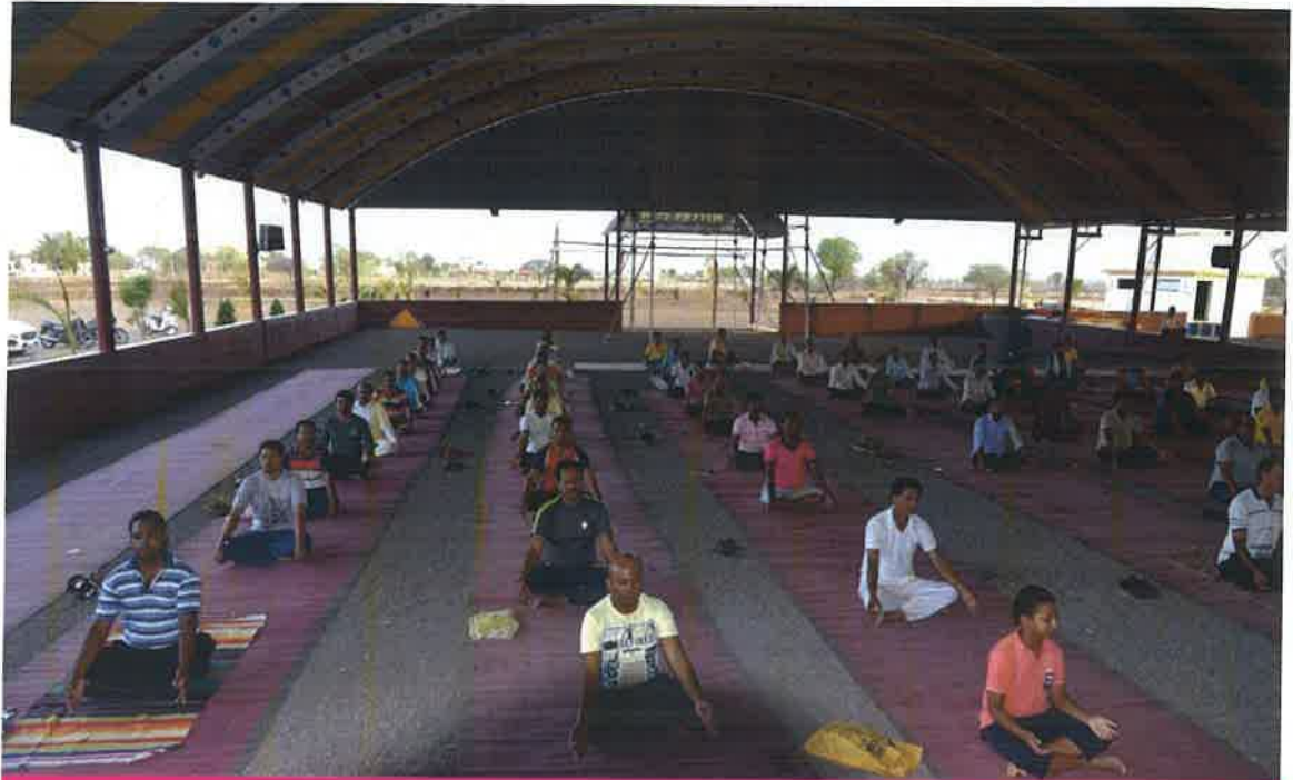
आंतरराष्ट्रीय योगा दिन - दि. २१/०६/२०१९