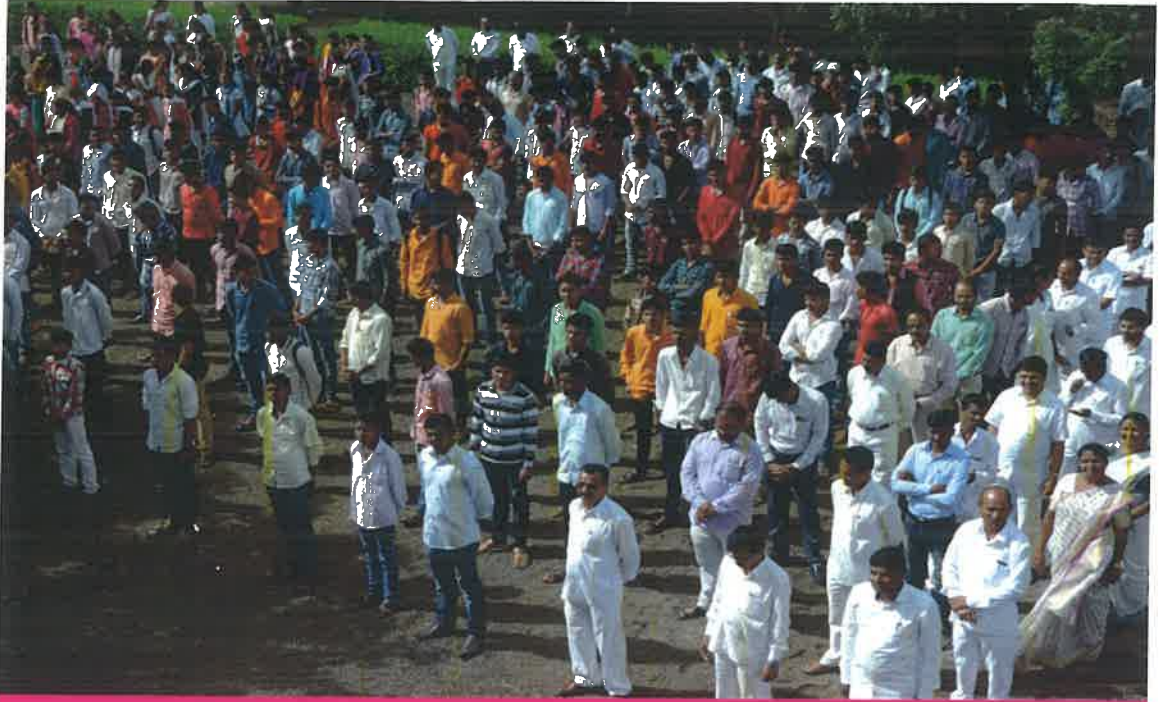
क्रांती दिन - दि.०९/०८/२०१९