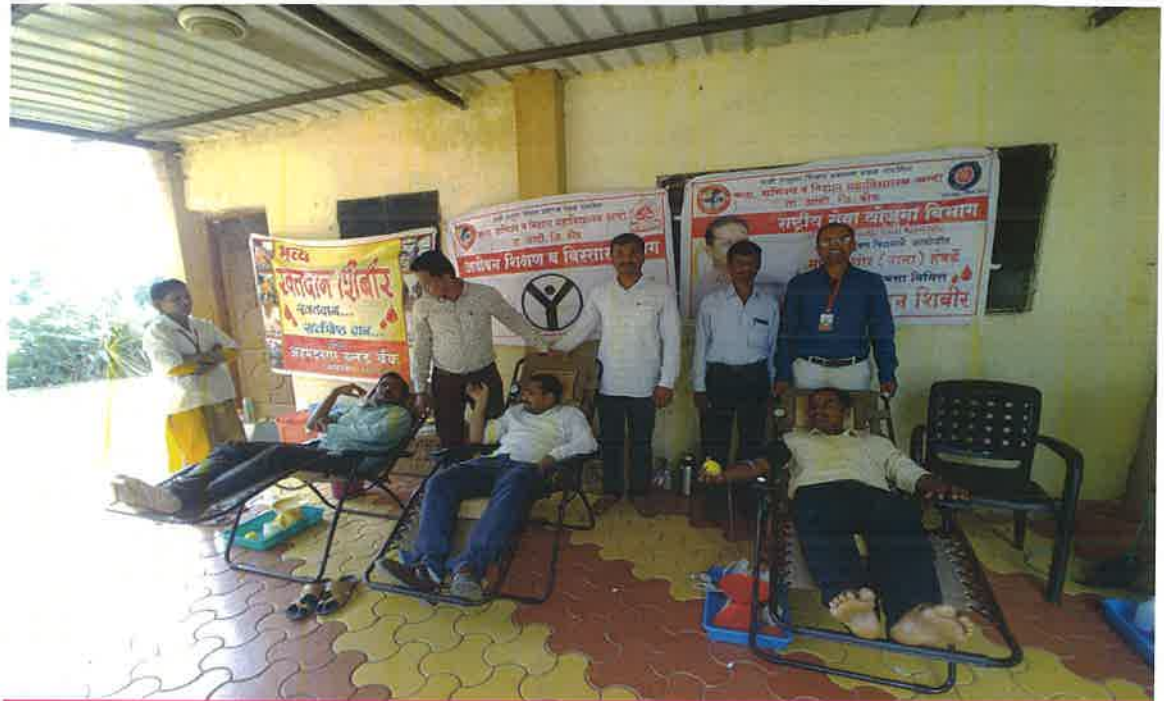
रक्तदान शिवीर दि. ११/११/२०१९