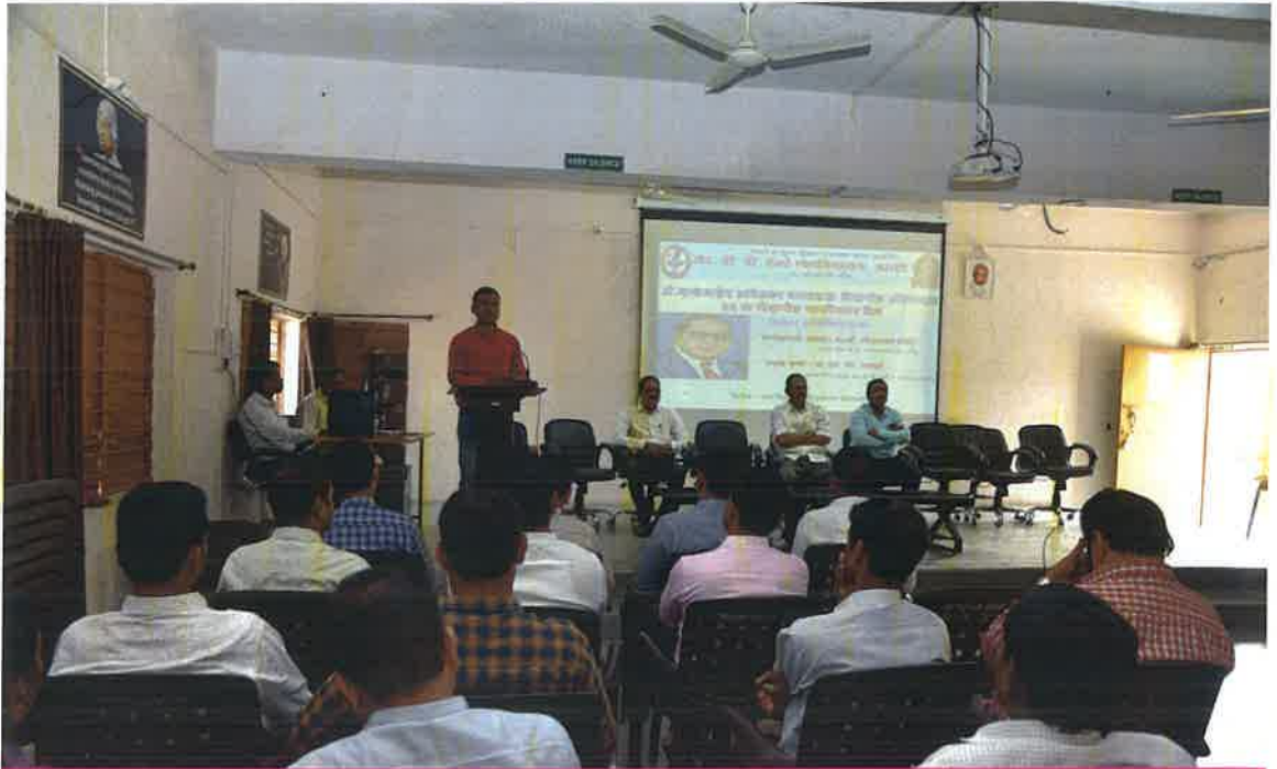
विद्यापीठ नामविस्तार दिन दि. १४/०१/२०२०

University Name Extension Day 14-01-2020