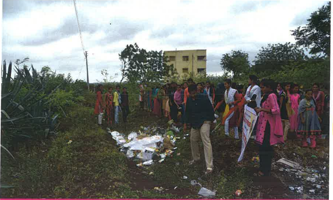
स्वच्छता हिच सेवा दि. ०२/१०/२०१९

Cleanliness Drive in college campus 02.10.2019