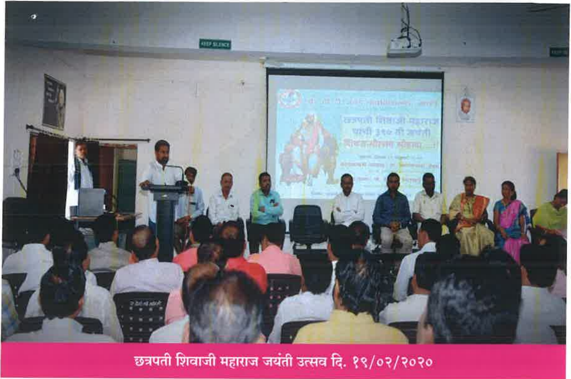
छत्रपती शिवाजी महाराज जयंती उत्सव दि. १९/०२/२०२०

Chhatrapati Shivaji Maharaj Jayanti 19.02.2020