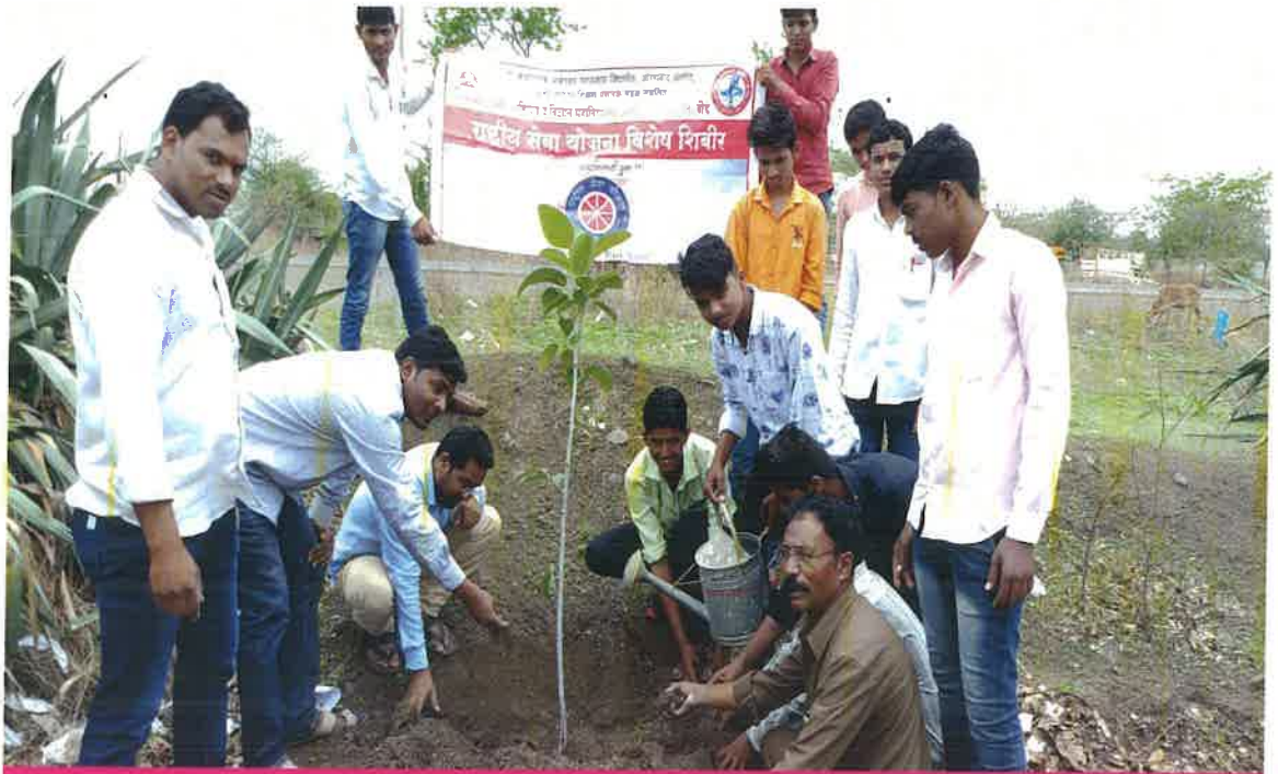
कृषी दिन - दि.०१/०७/२०१९