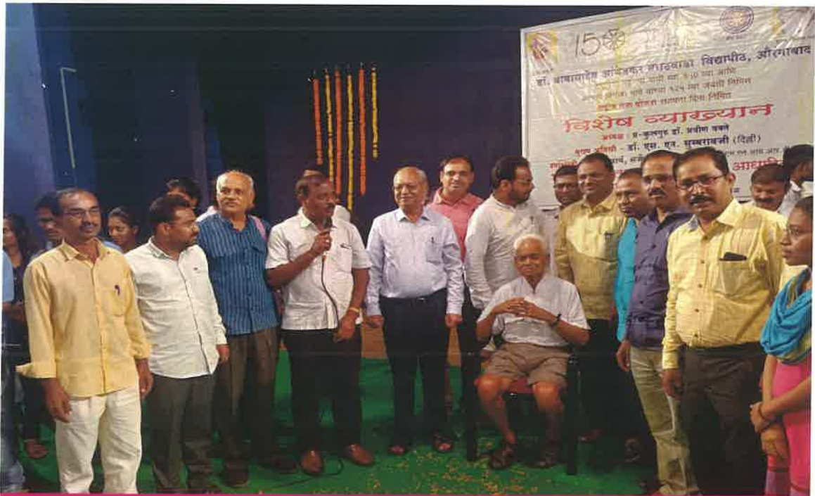
डि. सुब्बाराव यांचा कार्यक्रम शिबीर दि. २३/०९/२०१९

Counselling of girl student and distribution of uniforms 20-09-2019