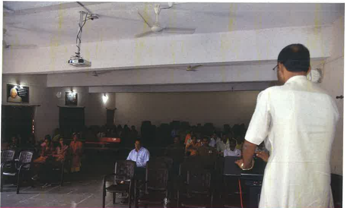
राजर्षी शाहु महाराज जयंती - दि. २६/०६/२०१९