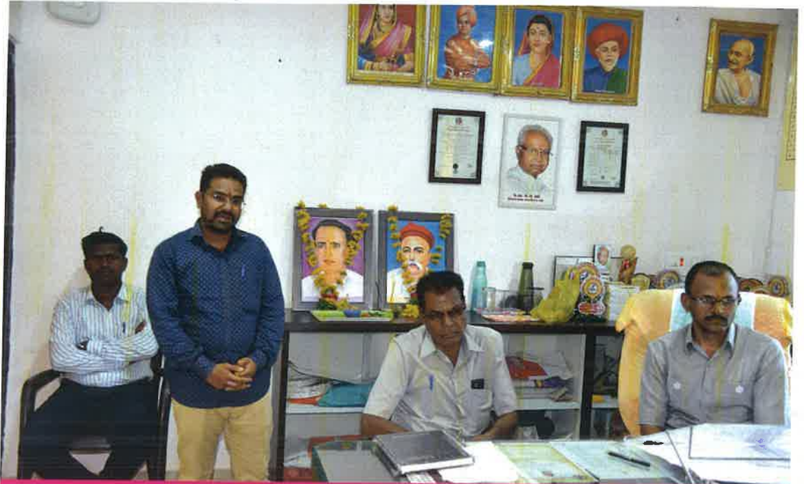
आण्णाभाऊ साठे जयंती व लोकमान्य टिळक पुण्यतिथी - दि.०१/०८/२०१९

Annabhau Sathe birth anniversary Lokmanya Tilak death anniversary 01.08.2019