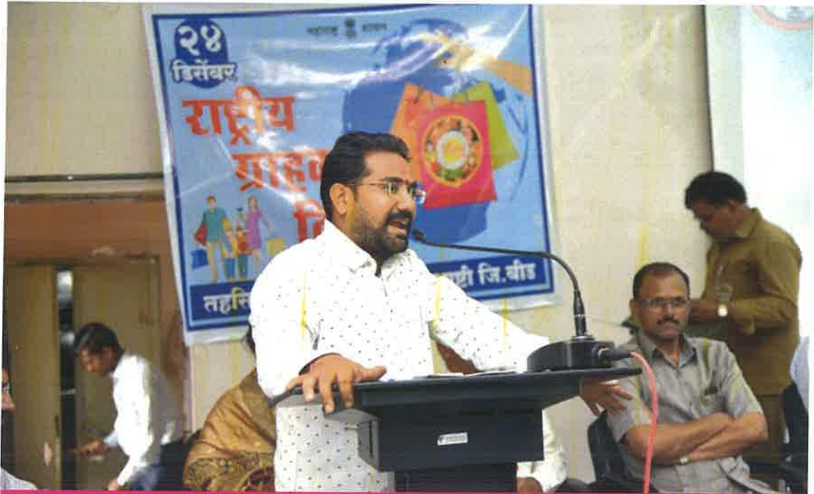
राष्ट्रीय ग्राहक दिन दि. २४/१२/२०१९