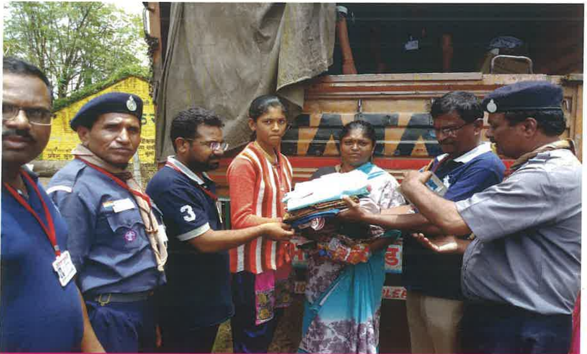
सांगली कोल्हापुर सातारा पुरग्रस्त मदत निधी वाटप दि. १७/०८/२०१९

Distribution of collected relief fund as a help to flood affected 16.08.2019