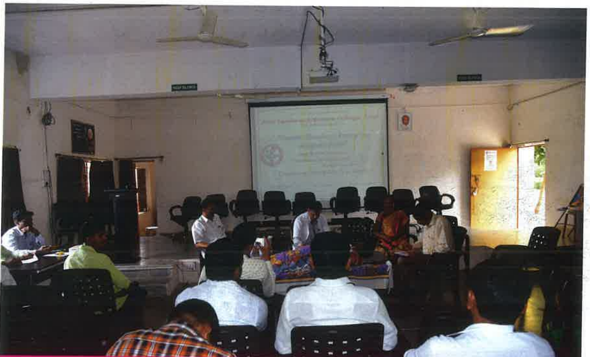
आरोग्य तपासणी शिबीर - दि.०३/०८/२०१९

Annabhau Sathe birth anniversary Lokmanya Tilak death anniversary 01.08.2019