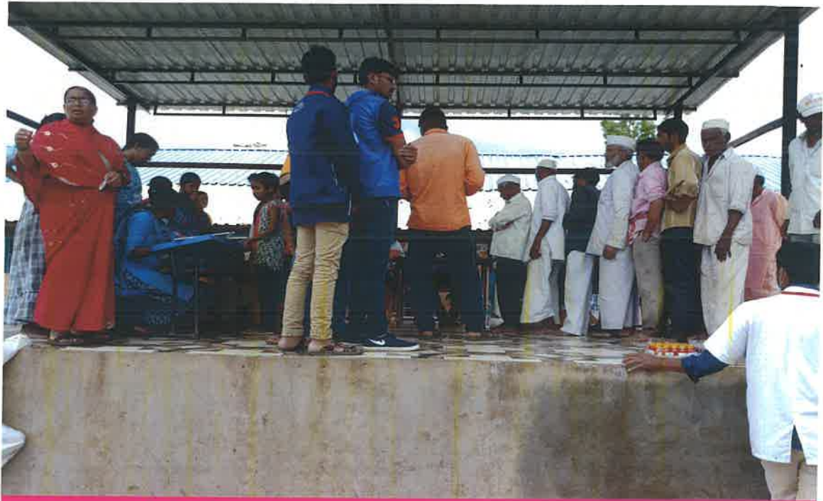
सांगली कोल्हापुर सातारा पुरग्रस्तांची आरोग्य तपासणी दि. १६/०८/२०१९

Health check up camp for the flood affected people of Sangali, Satara & Kolhapur 16.08.2019