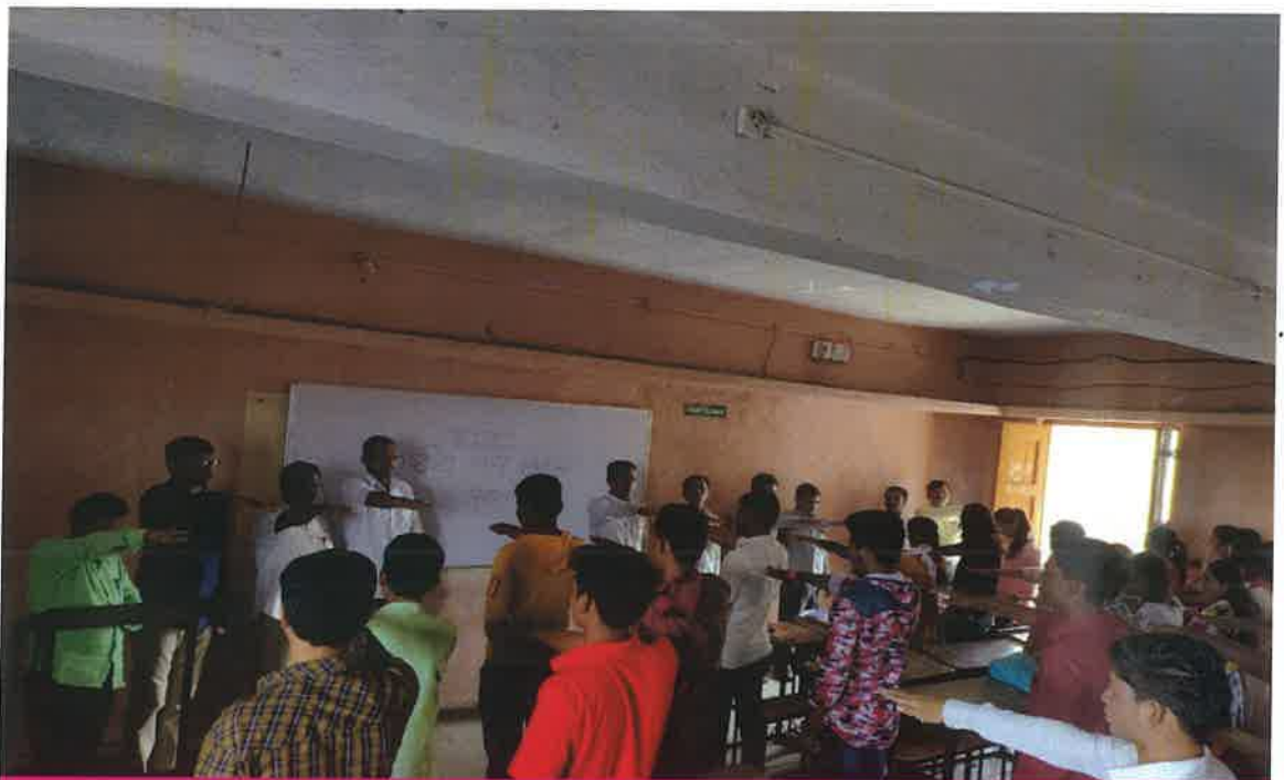
तंबाखु मुक्ती अभियान - दि.१६/०७/२०१९