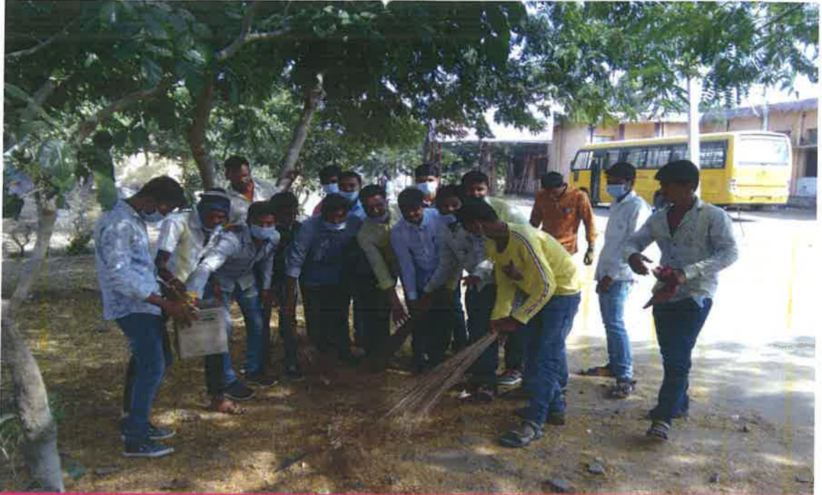
स्वच्छता हिच सेवा दि. ०२/१०/२०१९

cleanliness Drive in college campus 02.10.2019