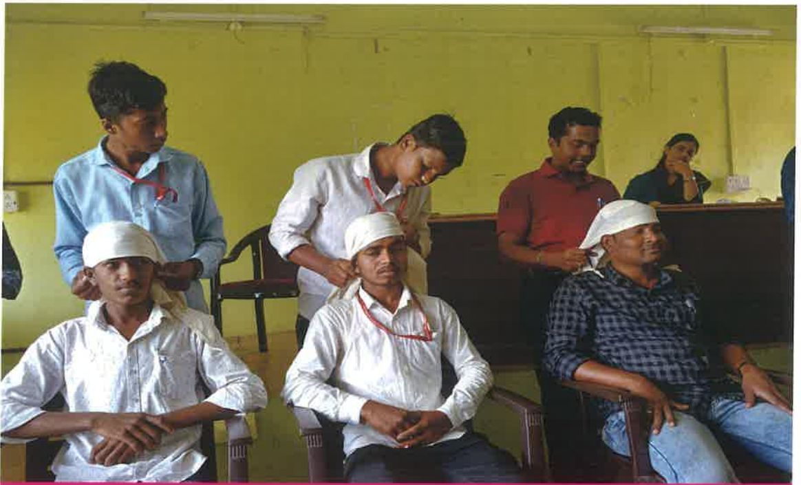
आपत्ती व्यवस्थापन प्रशिक्षण शिबीर

Cleanliness Drive in college campus 02.10.2019