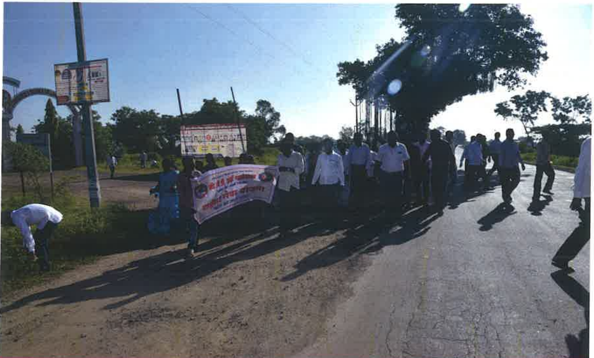
तंदरुस्त भारत अभियान दि. ०२/१०/२०१९

cleanliness Drive in college campus 02.10.2019