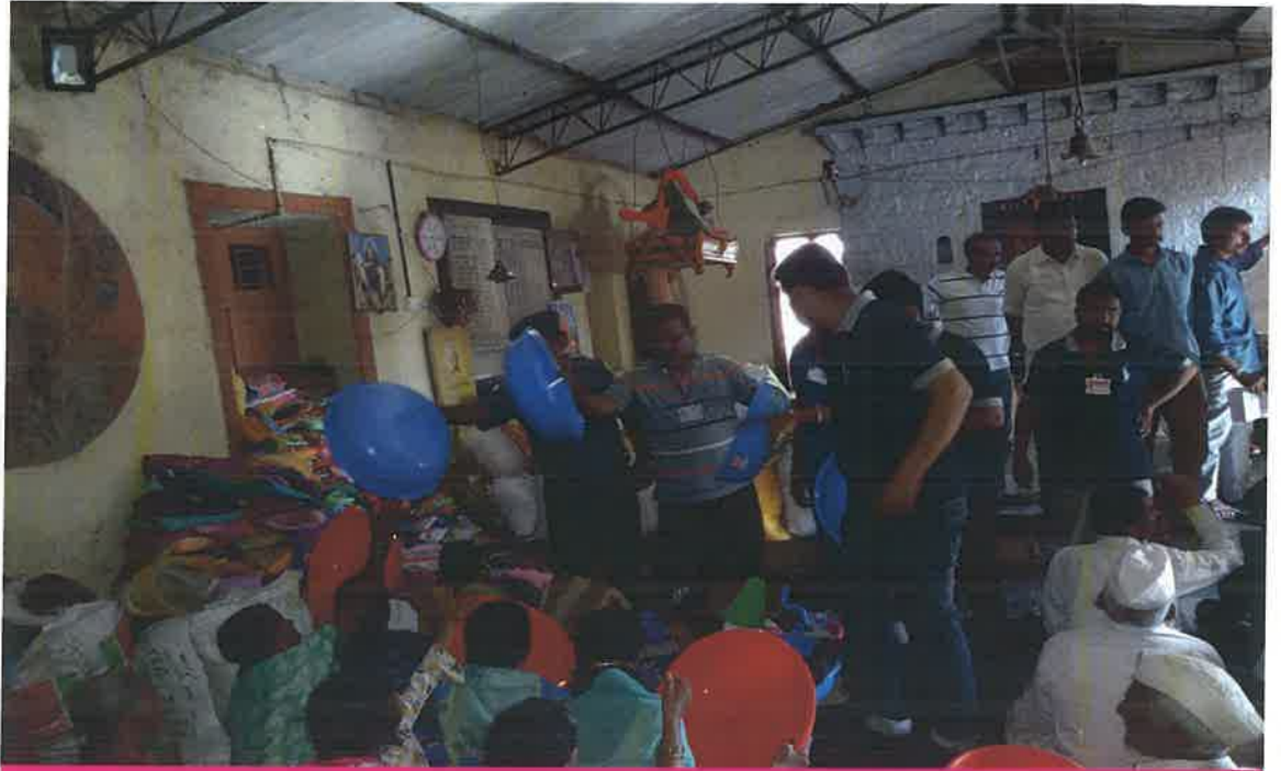
सांगली कोल्हापुर सातारा पुरग्रस्त मदत निधी वाटप दि. १६/०८/२०१९

Distribution of collected relief fund as a help to flood affected 16.08.2019