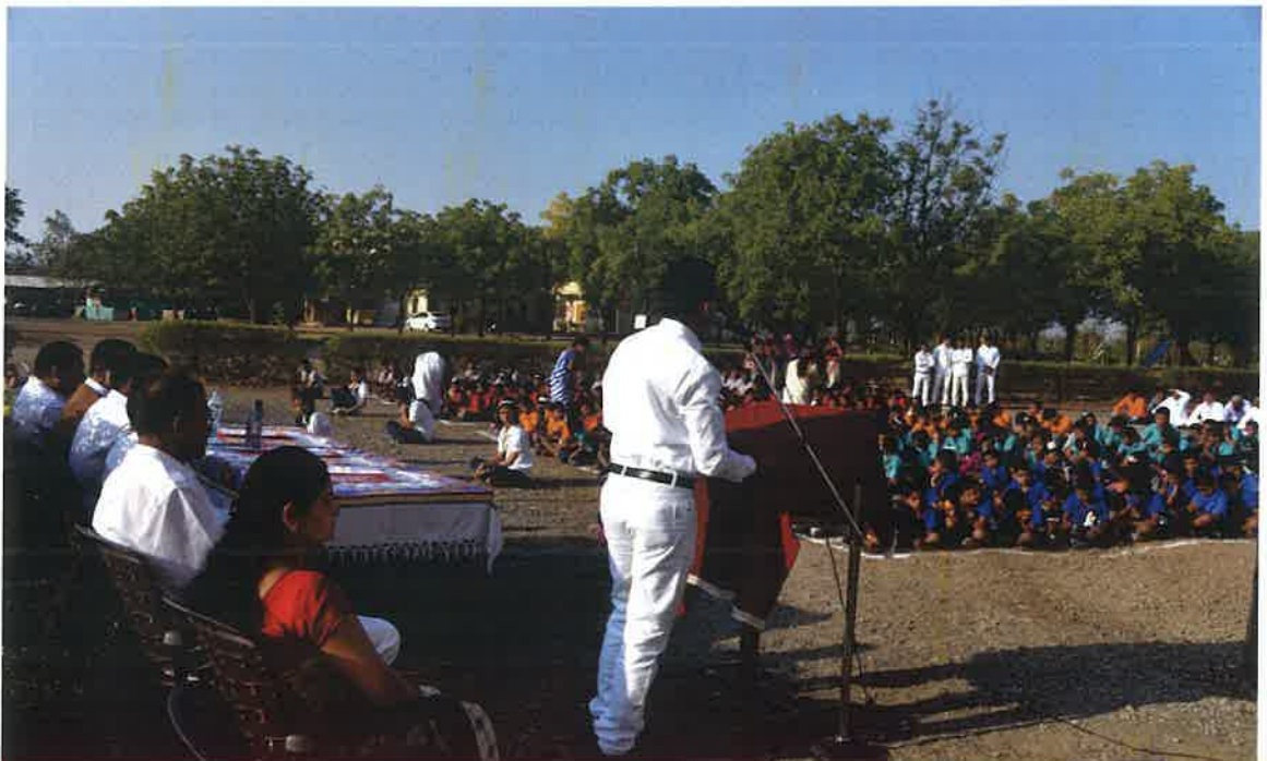
लोकशाही पंधरवाडा व प्रजासत्ताक दिन दि. २६/०१/२०२०

University Name Extension Day 14-01-2020