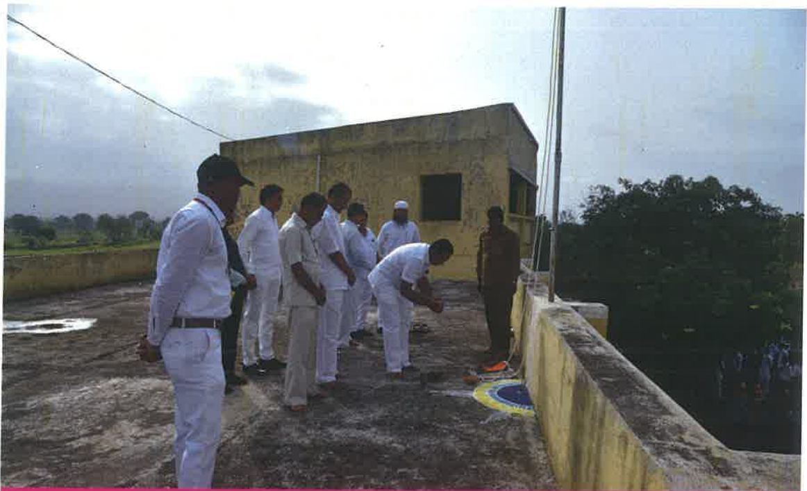
स्वातंत्र्य दिन दि. १५/०८/२०१९

Health check up camp for the flood affected people of Sangali, Satara & Kolhapur 16.08.2019