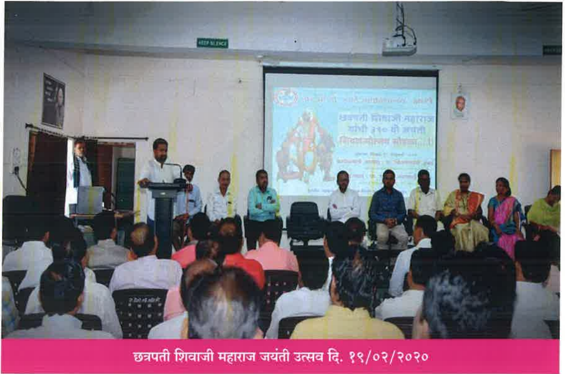
छत्रपती शिवाजी महाराज जयंती उत्सव दि. १९/०२/२०२०

Chhatrapati Shivaji Maharaj Jayanti 19.02.2020